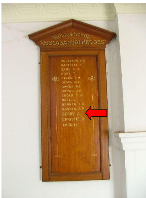
Yarrabandai Heroes Honour Roll